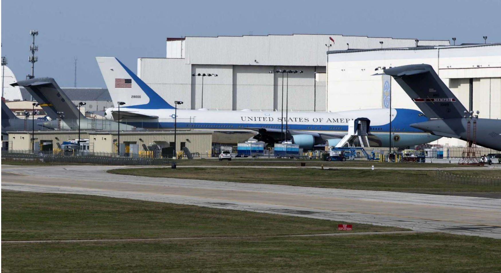
GDC Technics and Boeing Co. first entered into contracts in 2016 for GDC to refurbish and perform certain maintenance upgrades of Air Force One jets. One of the aircraft was photographed in 2017 at Boeing's repair facility at Port San Antonio.

Aircraft-modification company GDC Technics has hit some turbulence in charting a path to possibly emerge from bankruptcy or complete a sale of the business.